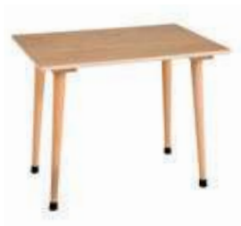
Table B2: Violet