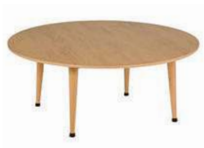
Group Table A1: Orange – Round