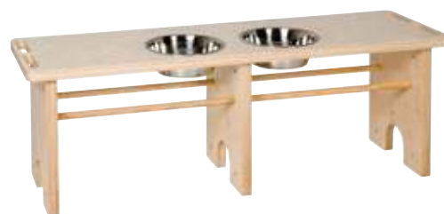
Dish Washing Table

The table has two removable metal bowls: one for water, the other for soap. Measures: 150 x 45 x 52 cm.