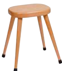
Stool E5: Green