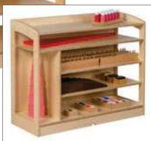
Sensorial Cabinet: Open Back (93 cm)

A cabinet with 5 shelves, 2 adjustable in height, suitable for children from 3 to 6 years of age. A panel to create a closed back cabinet and a caster set with can be ordered separately (respectively (Item Number: 157550 and 157560). The cabinet is shipped unmounted and flat-packed to save on delivery. Measures: 118 x 40 x 93 cm.