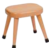
Stool A1: Orange

Our stools are made entirely of solid beech wood. They are produced under the strict guidelines of the EN1729 European Standard; the design is focused on optimum comfort and posture. The finishes are double-coated lacquer to facilitate cleaning and for long-term durability.