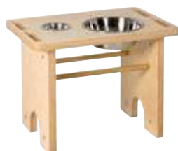
Hand Washing Table

The table has two removable metal bowls: a small one for holding a bar of soap and a larger one for the water. Measures: 68 x 45 x 52 cm.