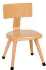
Chair B2: Violet