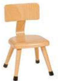
Chair A1: Orange

Our chairs are made to endure many years of repeated use. The frames and seats are made of solid beech wood and the backs are formed of top quality beech plywood. They are produced under the strict guidelines of the EN1729 European Standard; the design is focused on optimum comfort and posture. The finishes are double-coated lacquer to facilitate cleaning and for long-term durability.