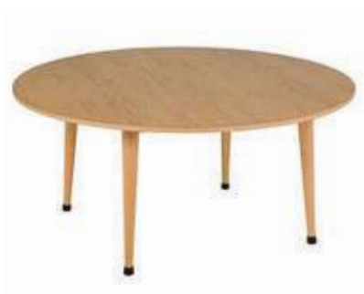
Group Table B2: Violet – Round