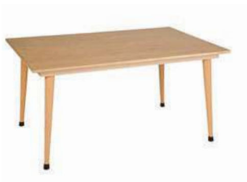
Group Table C3: Yellow