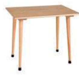
Table C3: Yellow