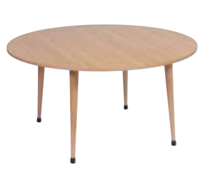
Group Table C3: Yellow – Round