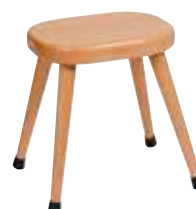
Stool C3: Yellow