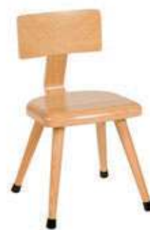
Chair C3: Yellow