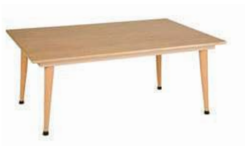
Group Table A1: Orange

Our table frames are made of solid beech wood and are coated with lacquer twice for a beautiful satin finish. The high quality tabletops are coated with a scratch resistant coating for long-term durability. They are produced under the strict guidelines of the EN1729 European Standard; the design is focused on optimum comfort and posture.