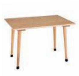
Table A1: Orange